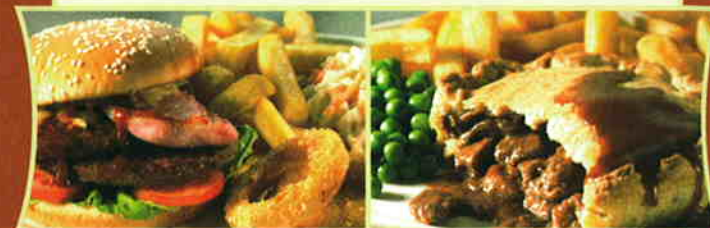
NEW YORK BURGER